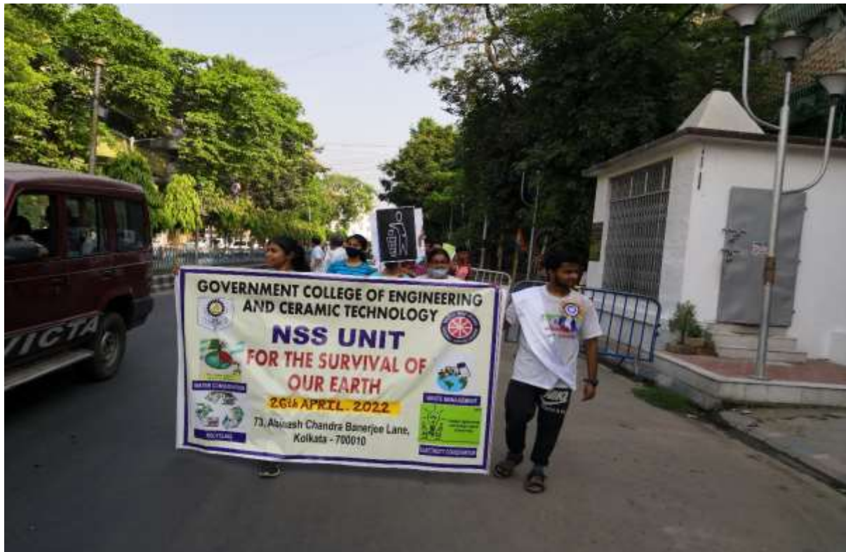
Figure 3: Rally on Environmental Awareness (26.04.2022)