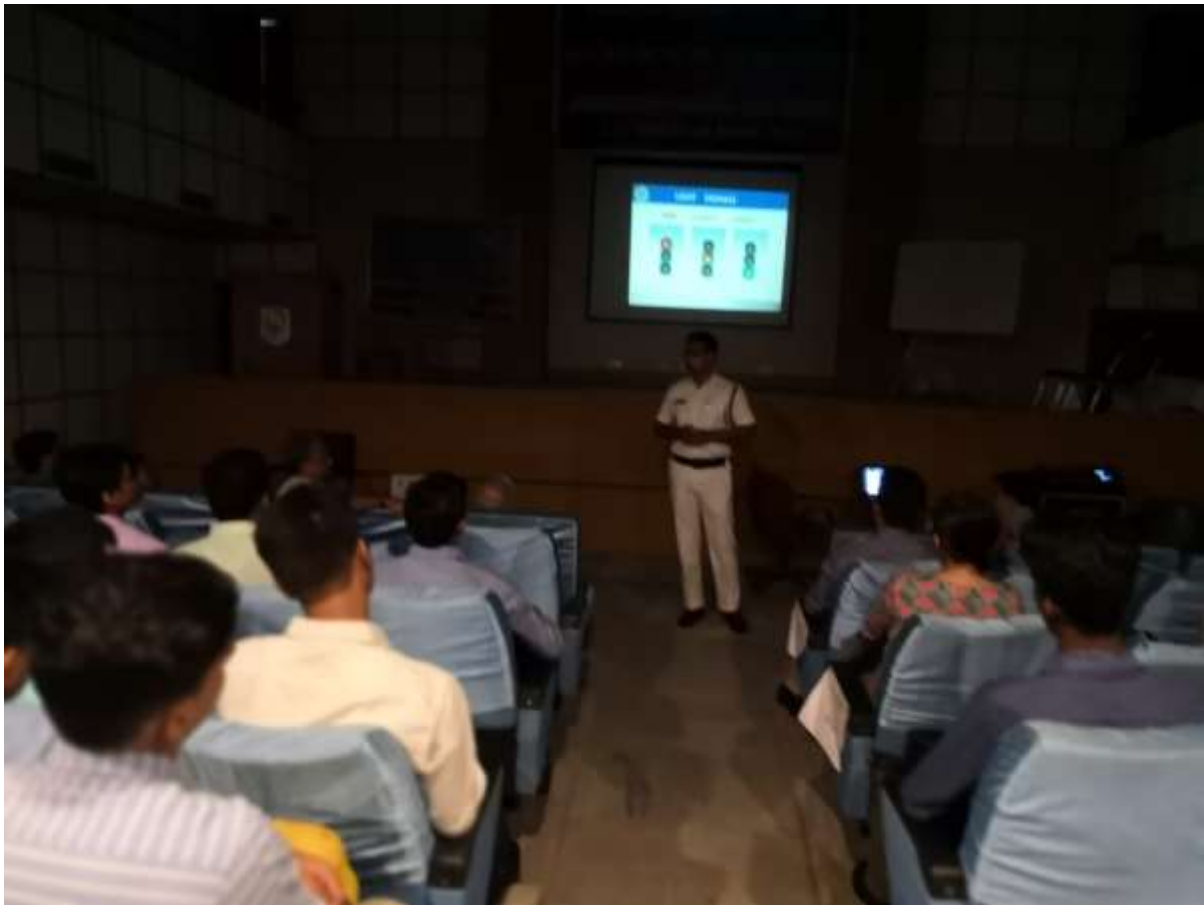
Figure 10: Safe Drive Save Life Program (06.08.2019)