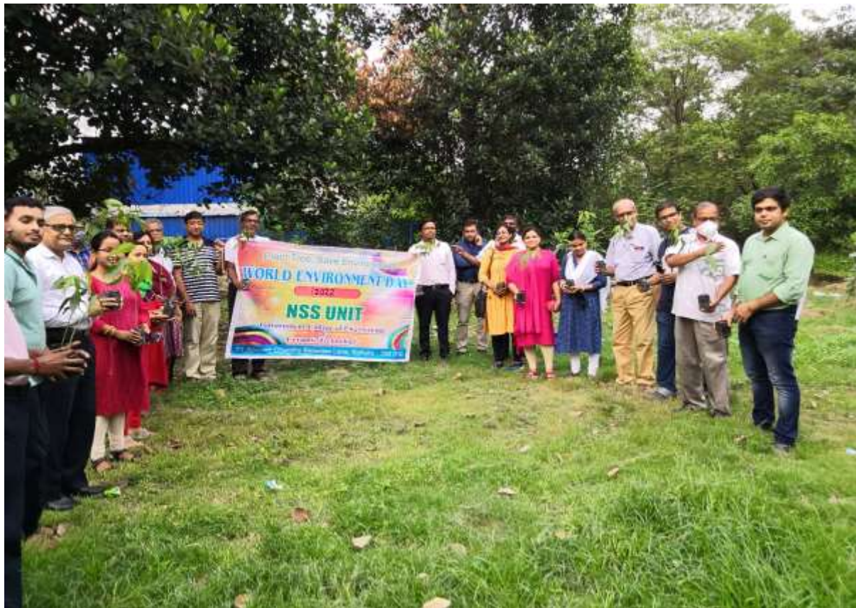
Figure 4: World Environment Day Celebration (05.06.2022)