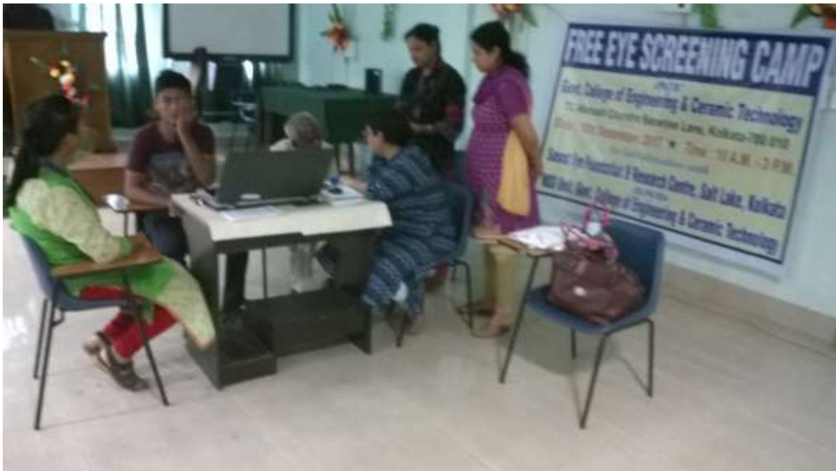
Figure 18: Eye Screening Camp (15.09.2017)