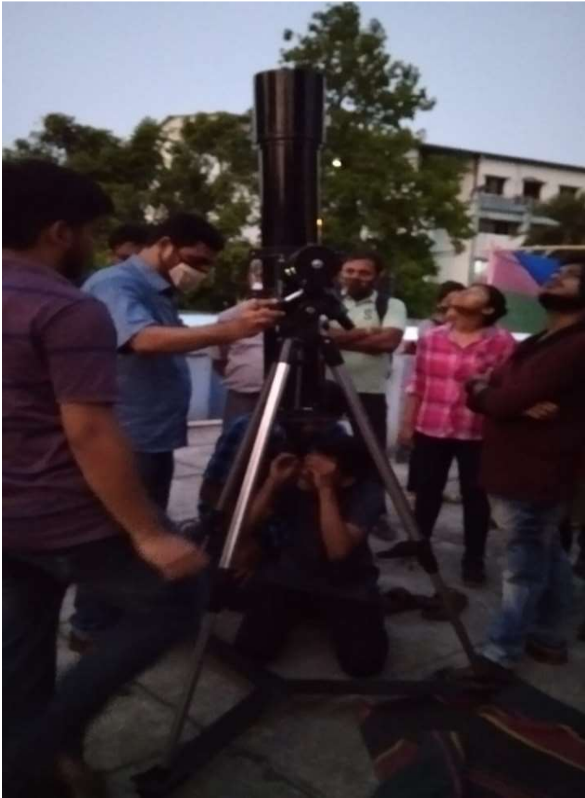
Figure 2: Sky Watching Camp (09.04.2022)