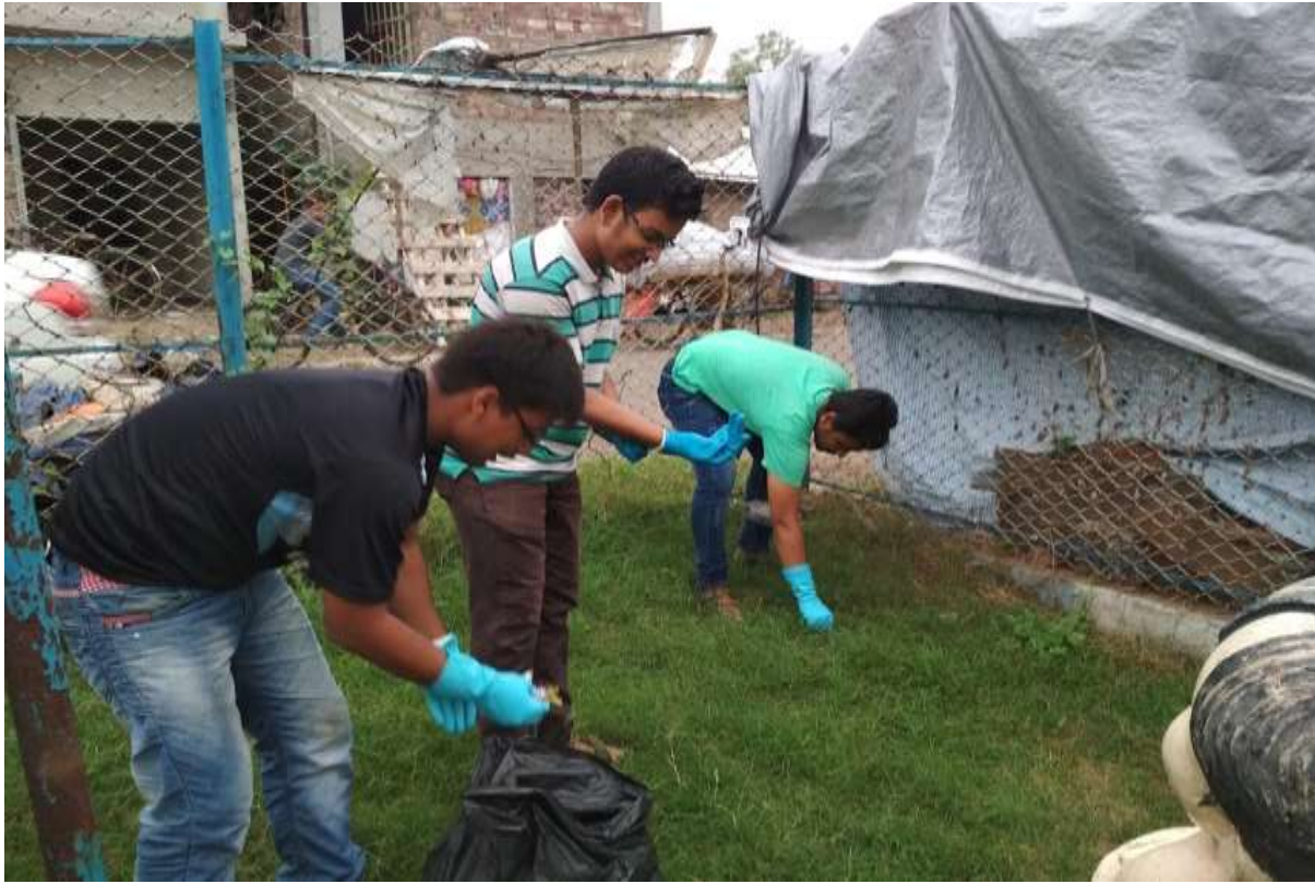
Figure 15: Swachh Bharat Program (June- July 2018)