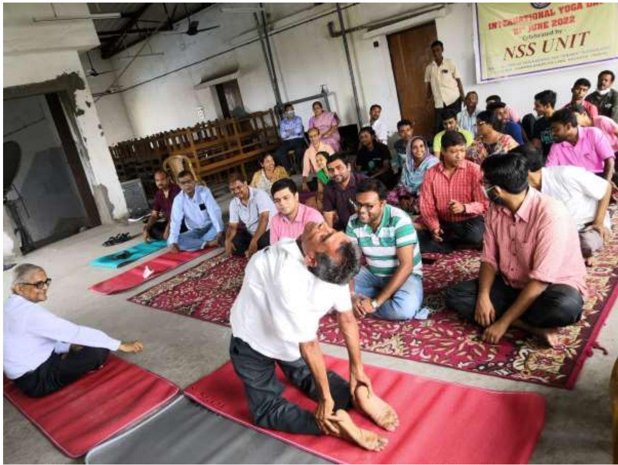
Figure 5: International Yoga Day Celebration (21.06.2022)