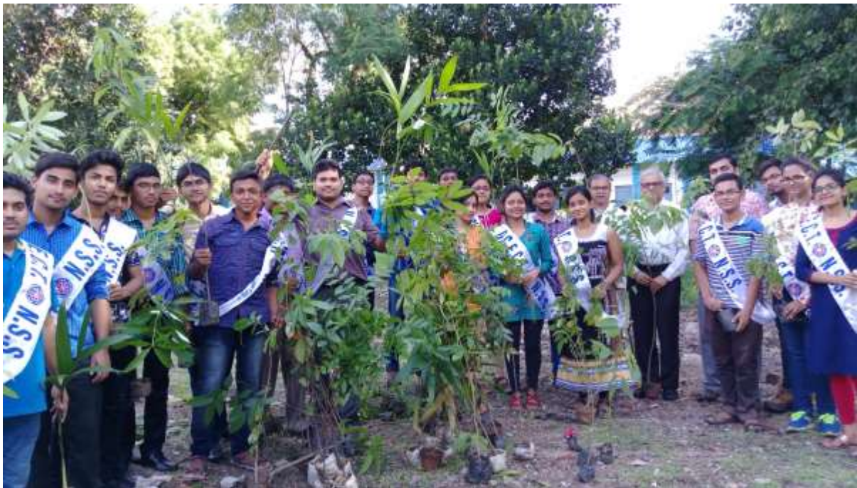
Figure 12: Sapling Plantation (05.06.2019)