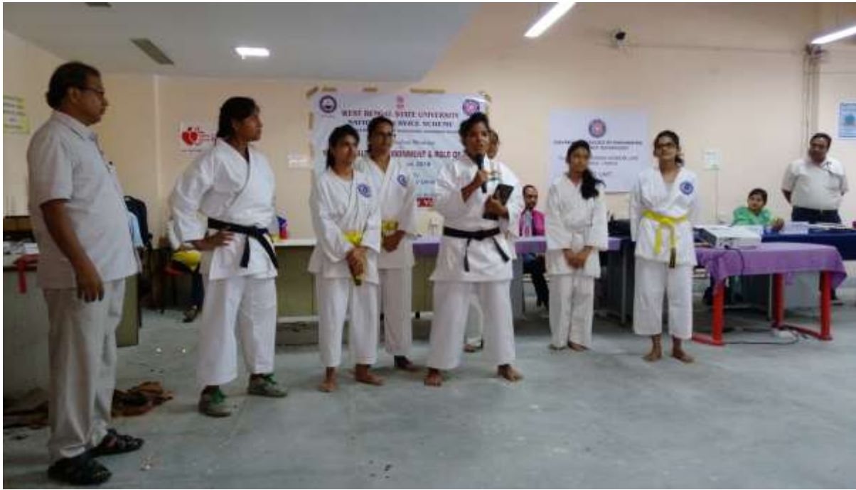
Figure 17: Karate Show (16.08.2018)