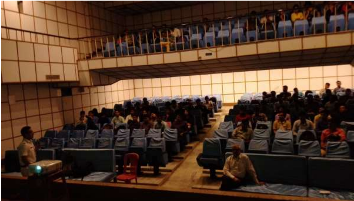
Figure 16: Safe Drive Save Life Program (13.08.2018)