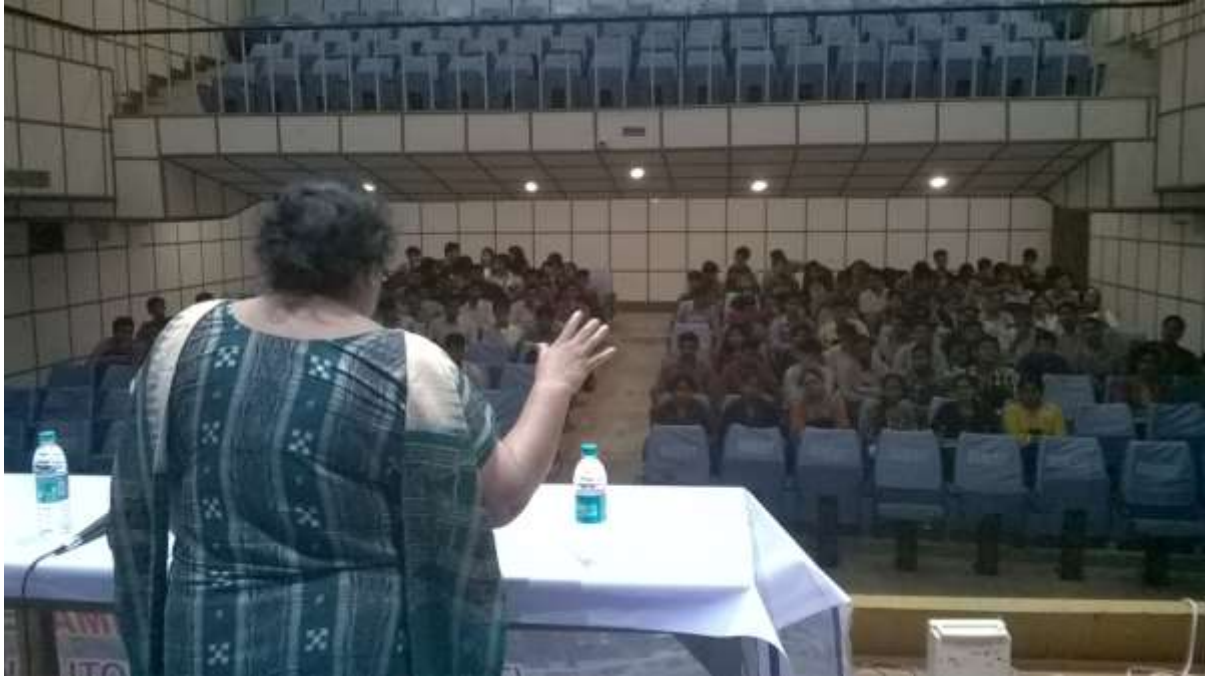
Figure 19: Lecture by NSS Regional Director on Gender Equity (31.08.2017)