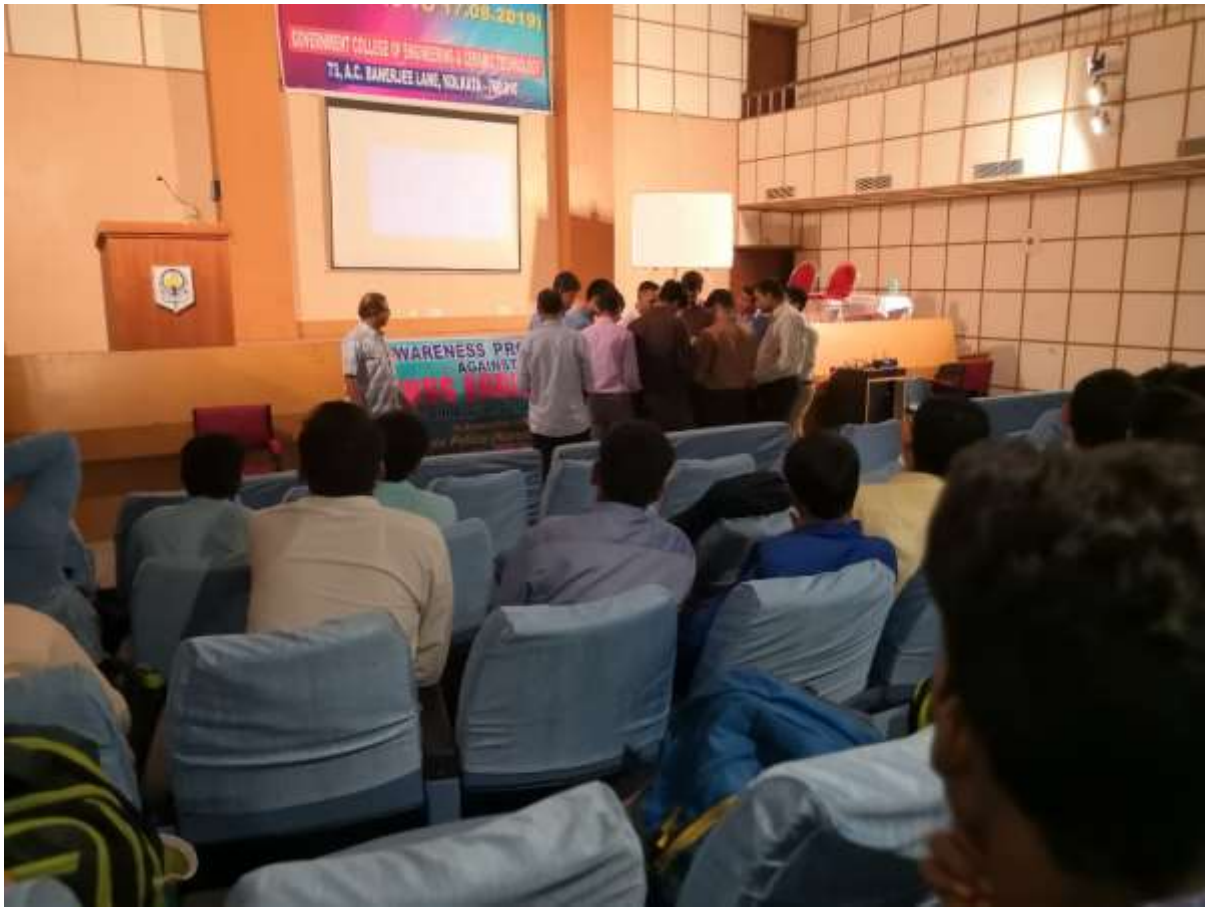
Figure 11: Anti-Drug Addiction (06.08.2019)