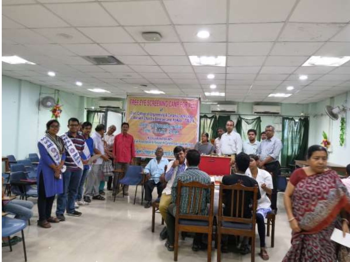
Figure 14: Eye Screening Camp (20.11.2018)