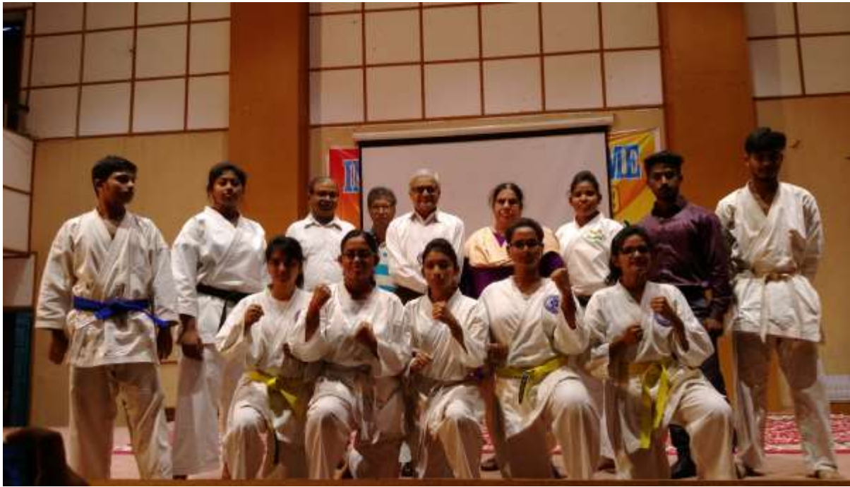
Figure 9: Karate Show (14.08.2019)