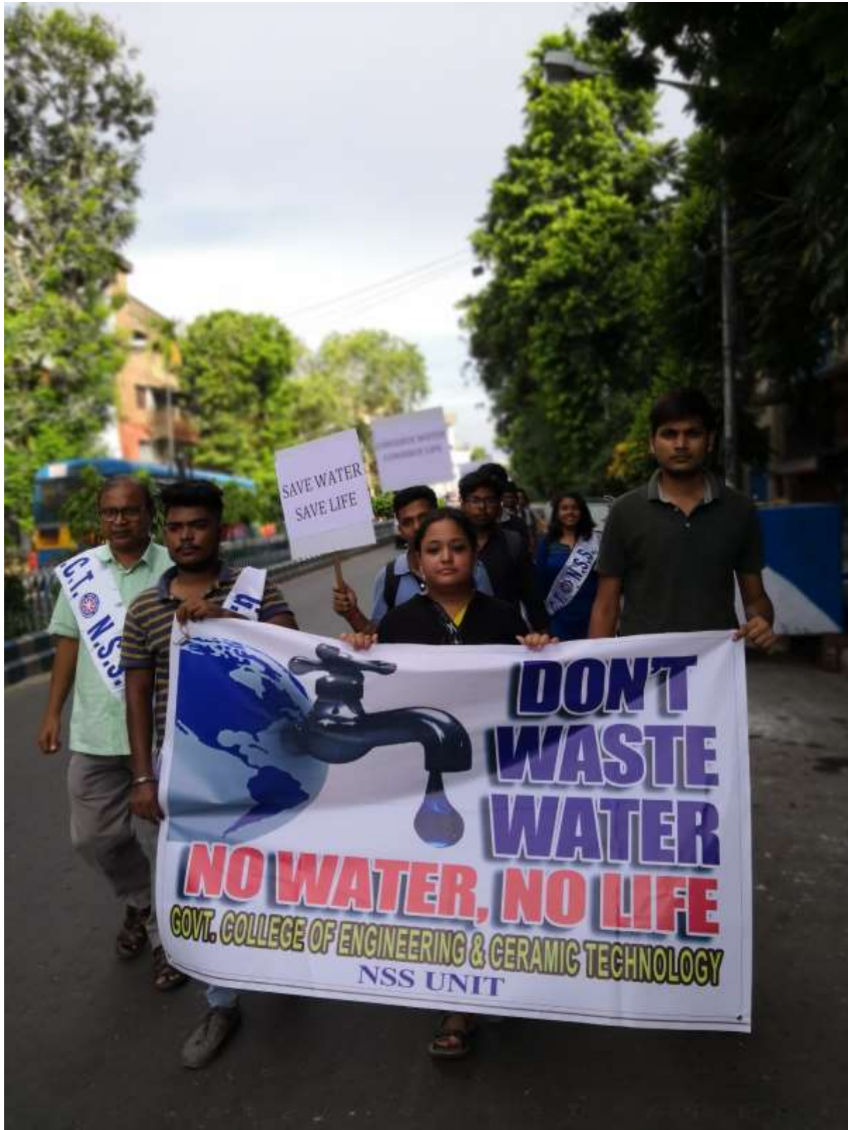
Figure 13: Save Water Save Life Program (23.07.2019)